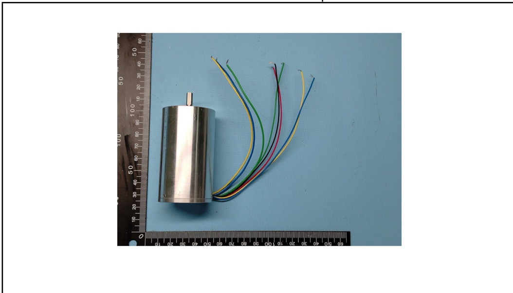
Photo of Submitted Sample